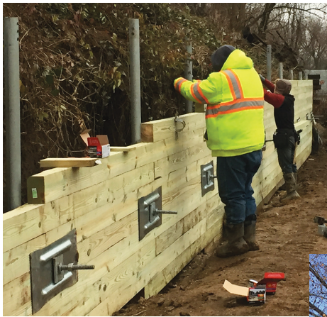
Continuing Placement of 4x6's

We had a Kubota 75 track loader available to move materials around.