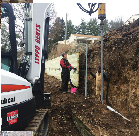
Installation of 34 Vertical Helical Piers and Setting the Wall.