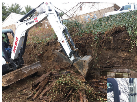
Demolition of Existing Failing Railroad-tie Wall.