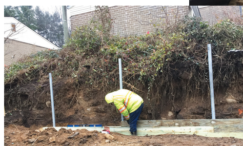
Setting the 240' Long Wall.