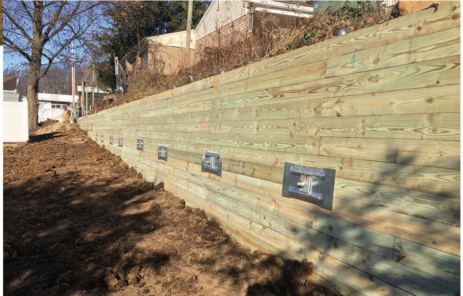
Completed Wall Supported by ECP Helical Screw Piling and Tiebacks.

The project took about a month to complete.