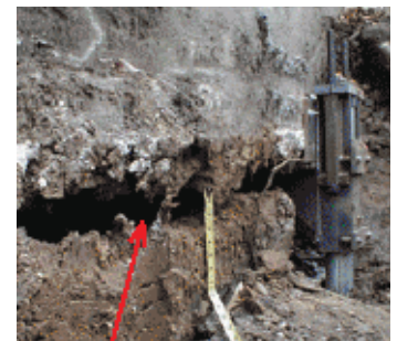
Raised 3 inches